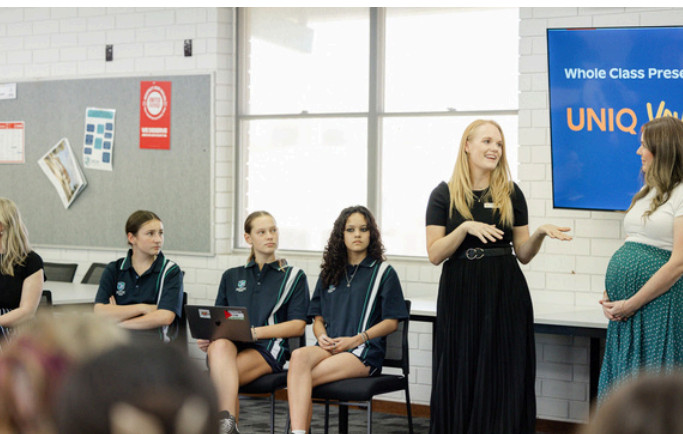
UNIQ YOU PRESENTING A SCHOLARSHIP TO THE SCHOOL

The session encouraged students to think about their future pathways, ask questions, and consider industries they may not have previously explored.