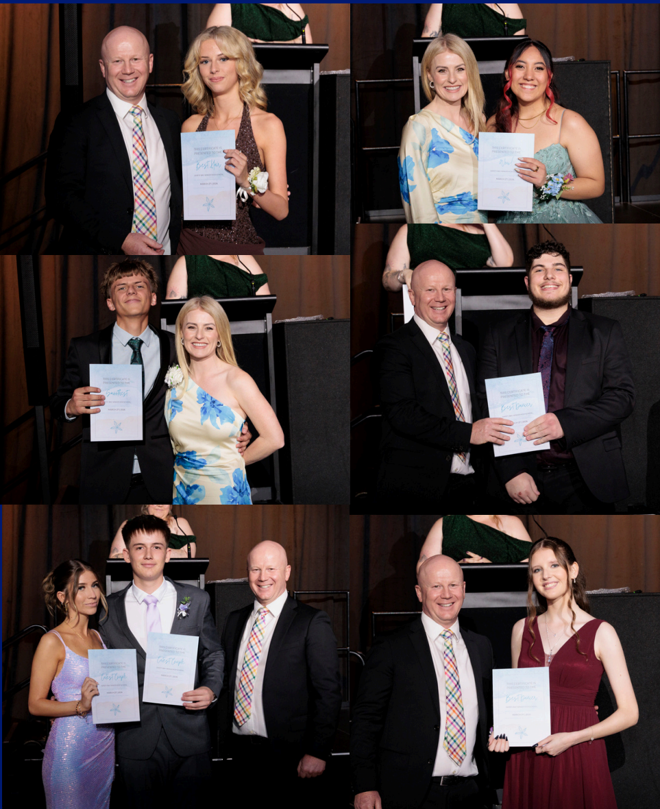
BELLE AND BEAU OF THE BALL 2026