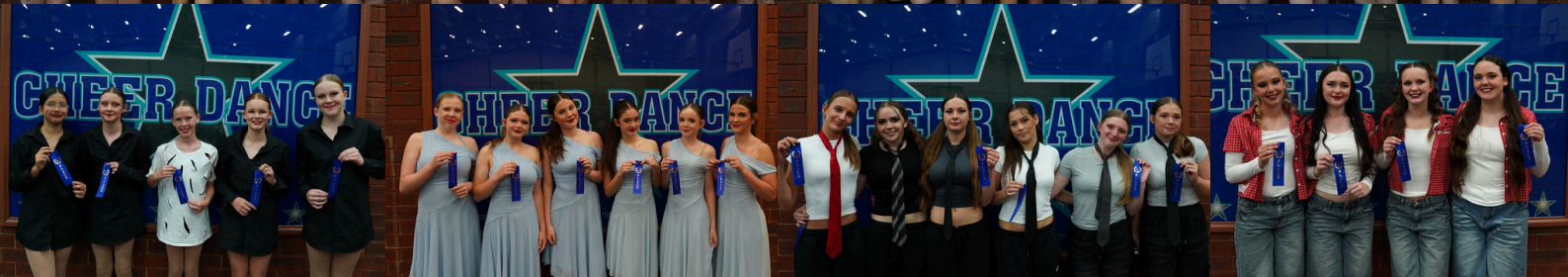
'ELECTRIC STORM' - YR 7