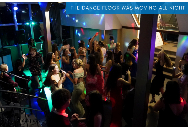
THE DANCE FLOOR WAS MOVING ALL NIGHT