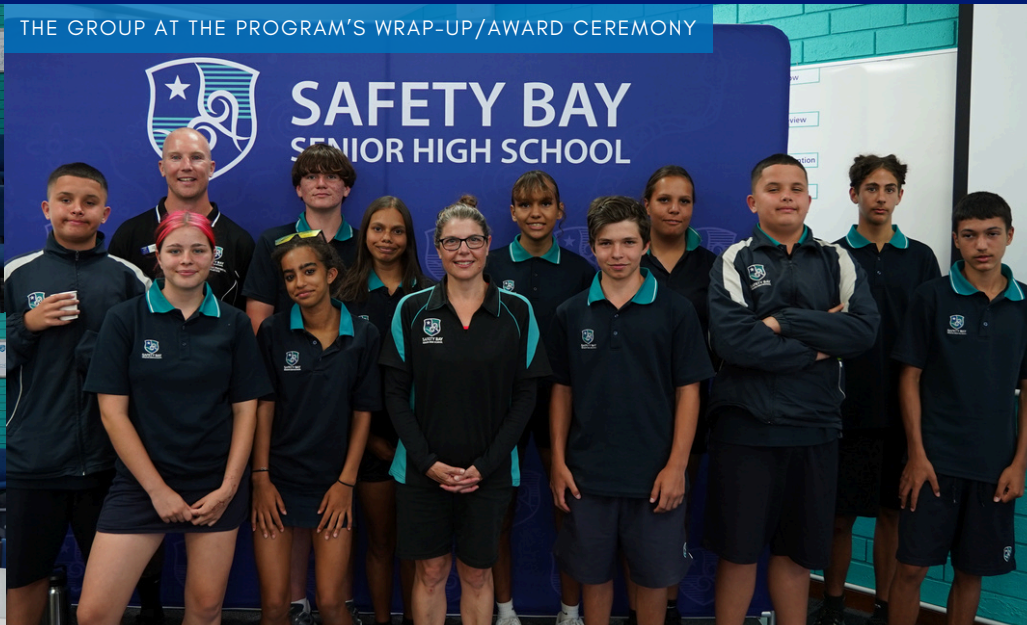
THE GROUP AT THE PROGRAM'S WRAP-UP/AWARD CEREMONY