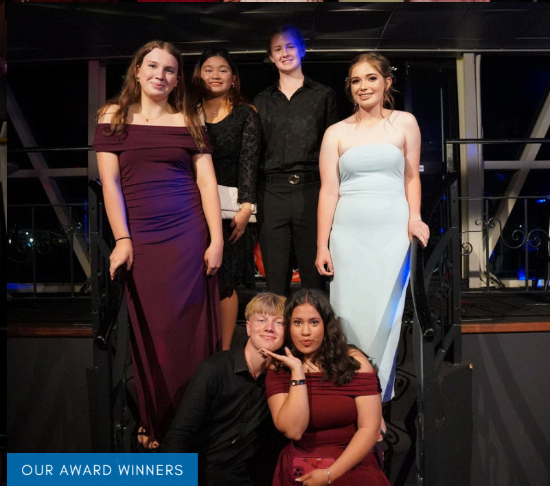
OUR AWARD WINNERS