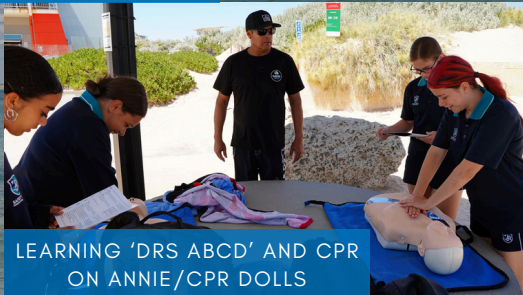
LEARNING 'DRS ABCD' AND CPR ON ANNIE/CPR DOLLS