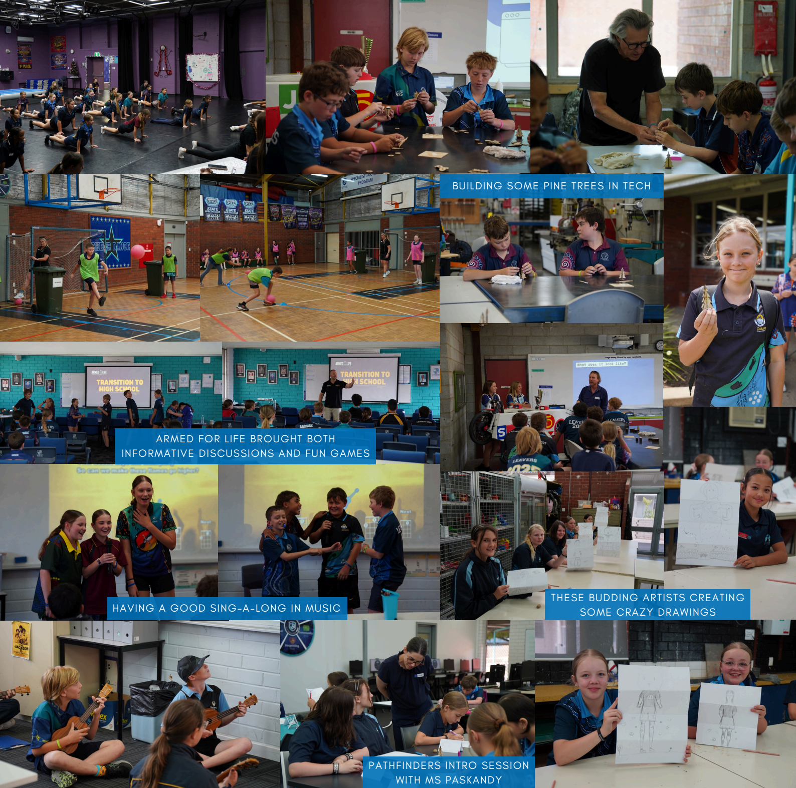
BUILDING SOME PINE TREES IN TECH