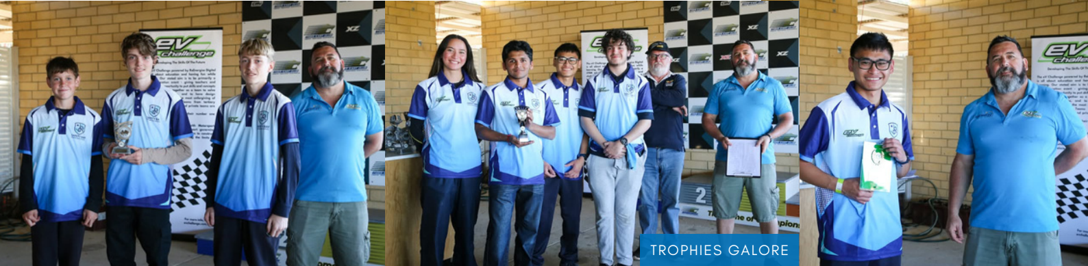
JUNIORS CLEANING UP AT THE AWARDS