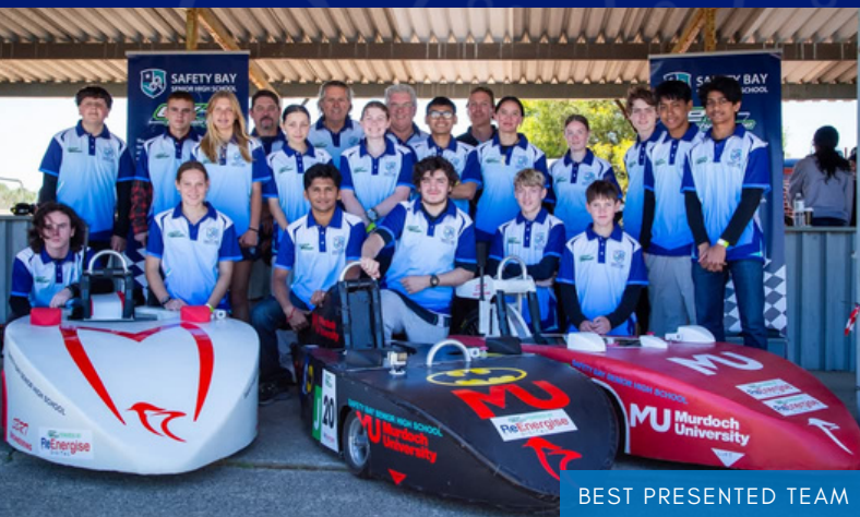
BEST PRESENTED TEAM