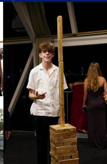
IMPRESSIVE - ON A MOVING BOAT!