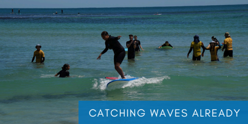
CATCHING WAVES ALREADY