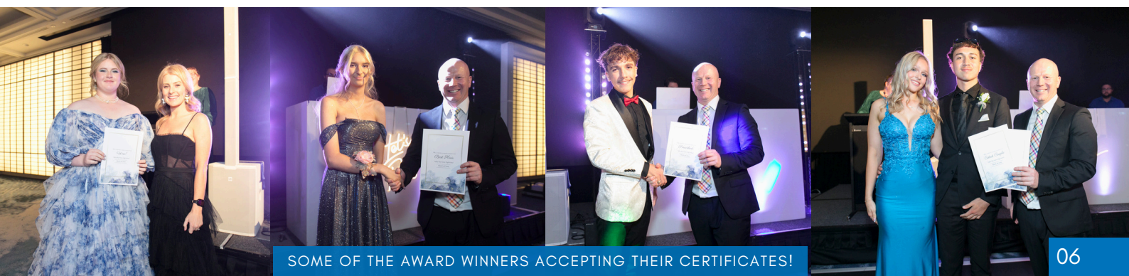
SOME OF THE AWARD WINNERS ACCEPTING THEIR CERTIFICATES!