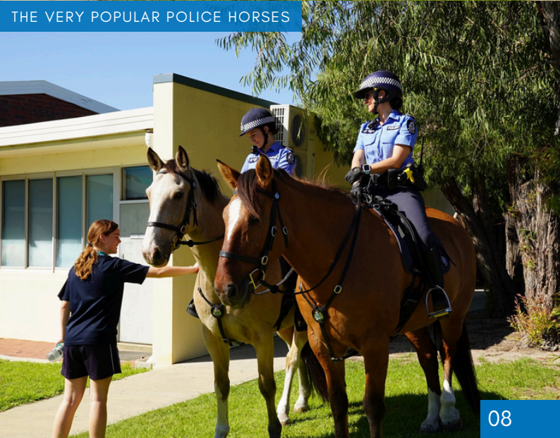
THE VERY POPULAR POLICE HORSES