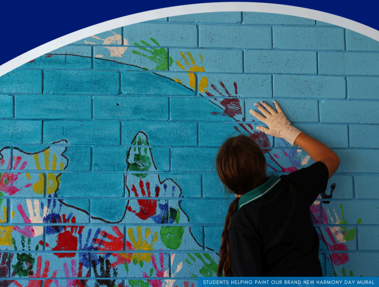
STUDENTS HELPING PAINT OUR BRAND NEW HARMONY DAY MURAL