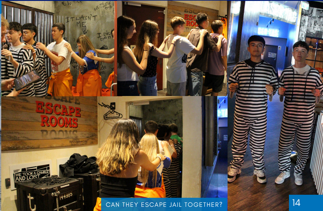
CAN THEY ESCAPE JAIL TOGETHER?