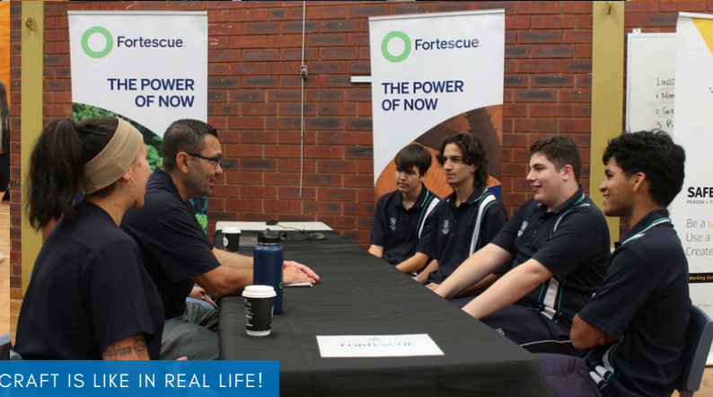
FINDING OUT WHAT MINECRAFT IS LIKE IN REAL LIFE!