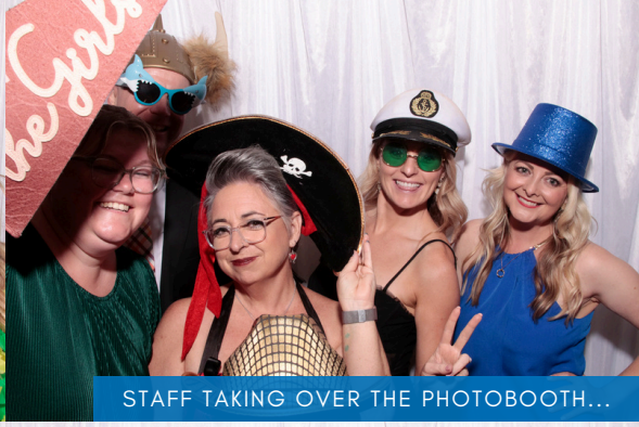
STAFF TAKING OVER THE PHOTOBOOTH...