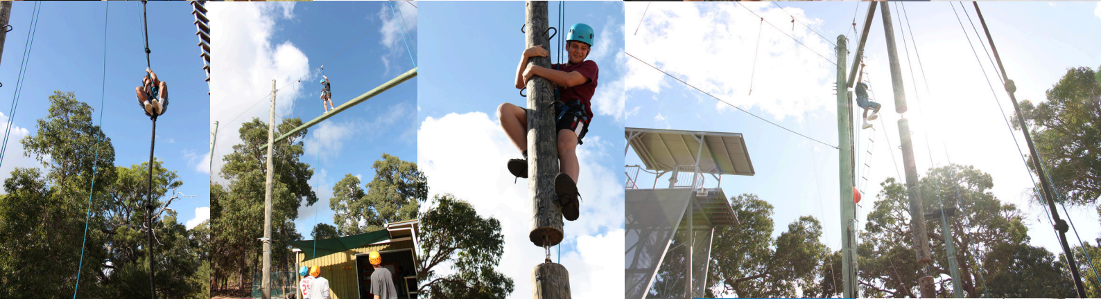
HIGH ROPE ANTICS

"The highlights of camp for me was almost all of it. The nights were the better bits, especially when we went to Carousel for the night. To the Year 9s and 10s that go on camp in Term 3, make sure to participate, make memories and have fun."