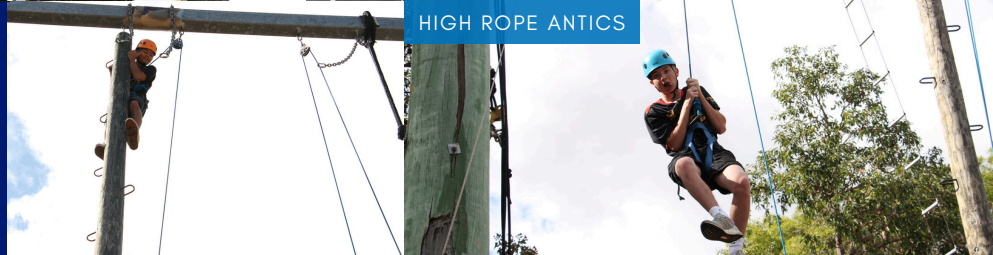
THE 'DON'T GET GOT' CHAMPS