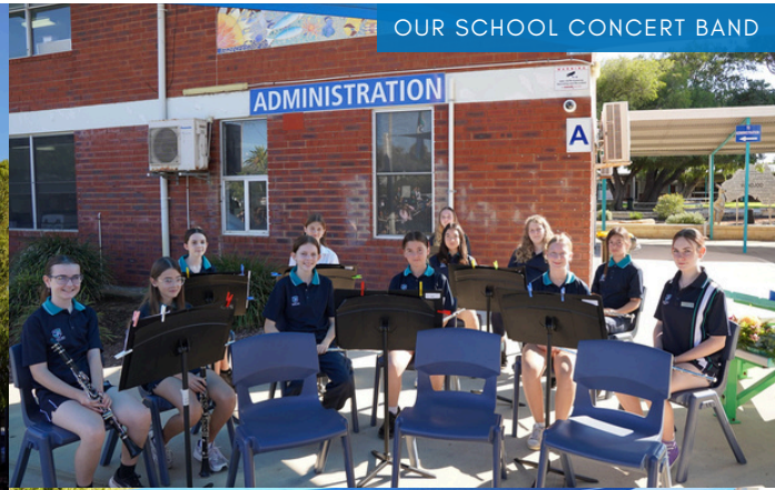
OUR SCHOOL CONCERT BAND