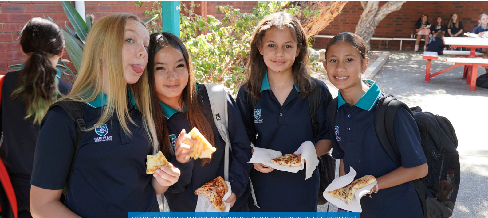
STUDENTS WITH GOOD STANDING ENJOYING THEIR PIZZA REWARD!