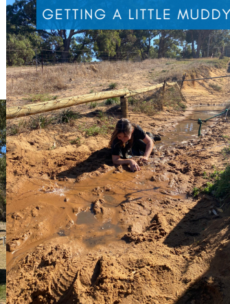
GETTING A LITTLE MUDDY