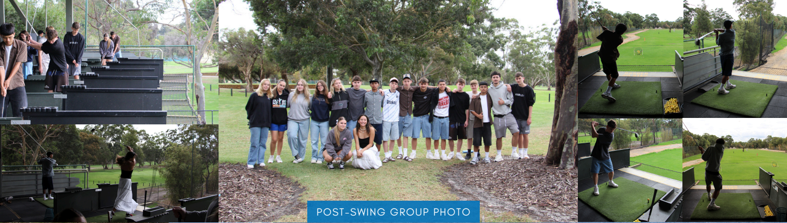
POST-SWING GROUP PHOTO