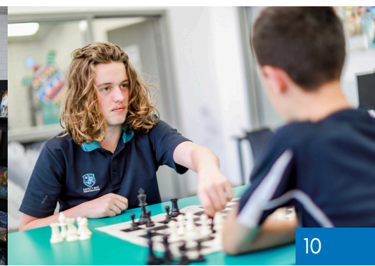
OUR LATEST CHESS TOURNAMENT WINNER