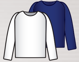
White or blue undershirt