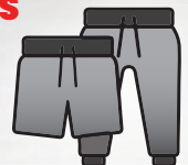
Non-blue pants or shorts