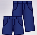
Denim of any kind